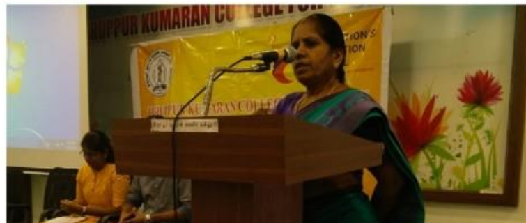
The pictures captured in the time of discussion about upcoming activities